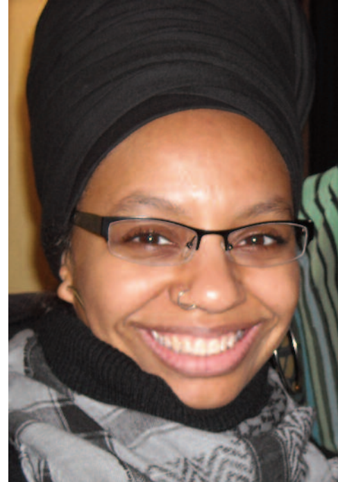
Co-Producer Kauthar Umar.