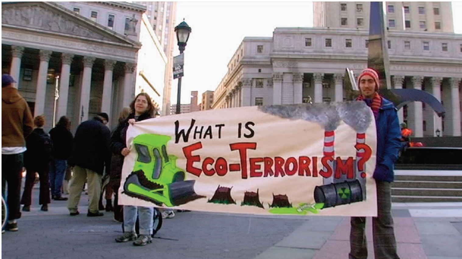
Demonstrators in New York City question the term “eco-terrorism”