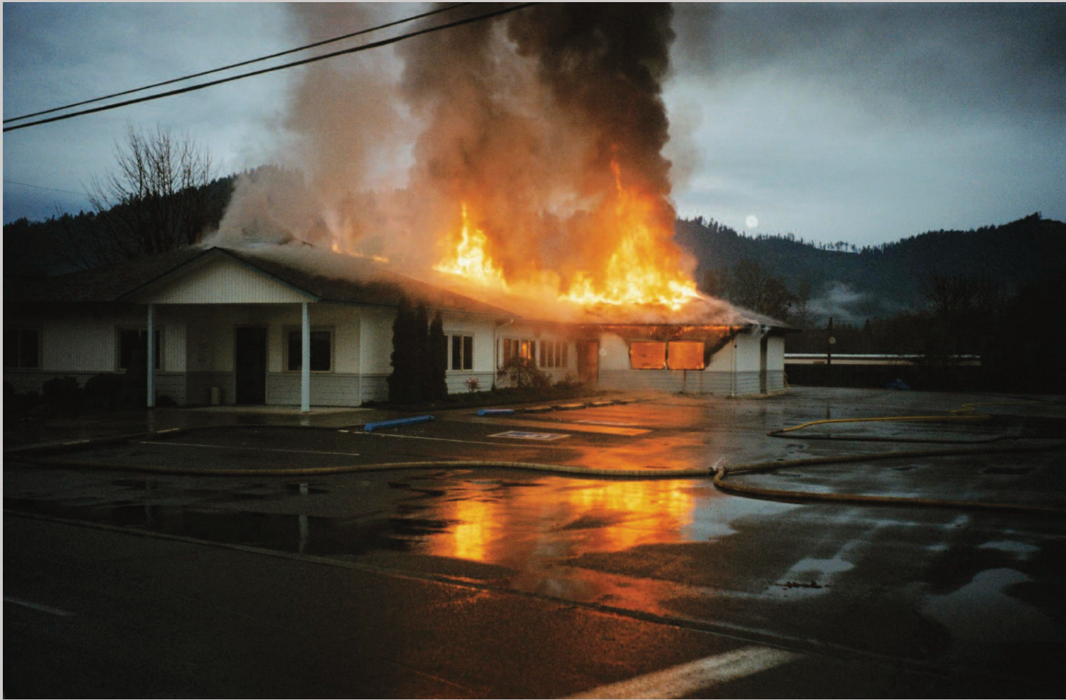
ELF Fire at Superior Lumber