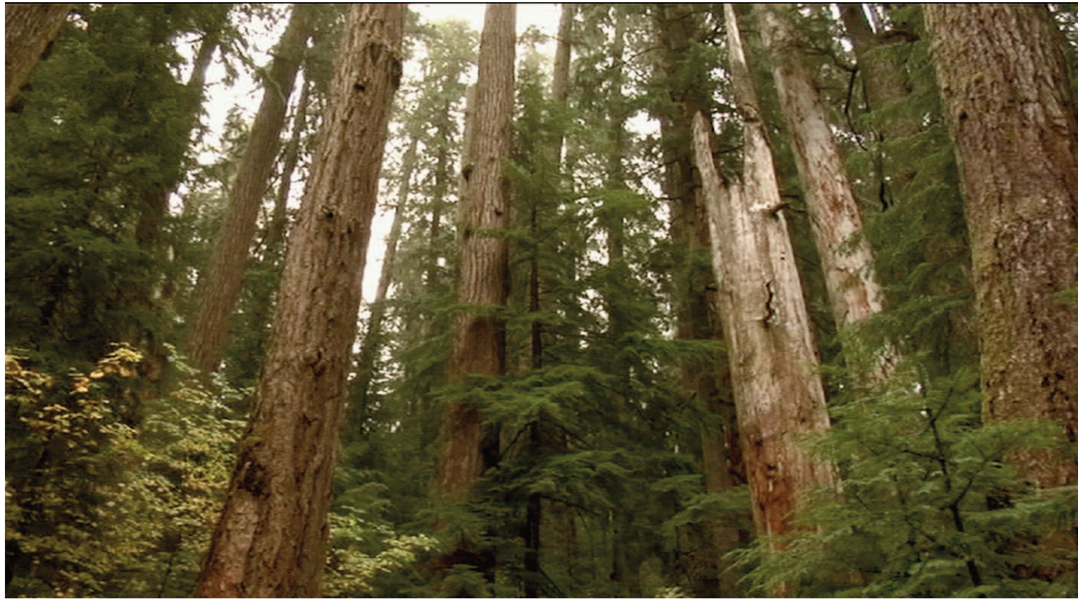
Scene from the film Photo still from “If a Tree Falls”