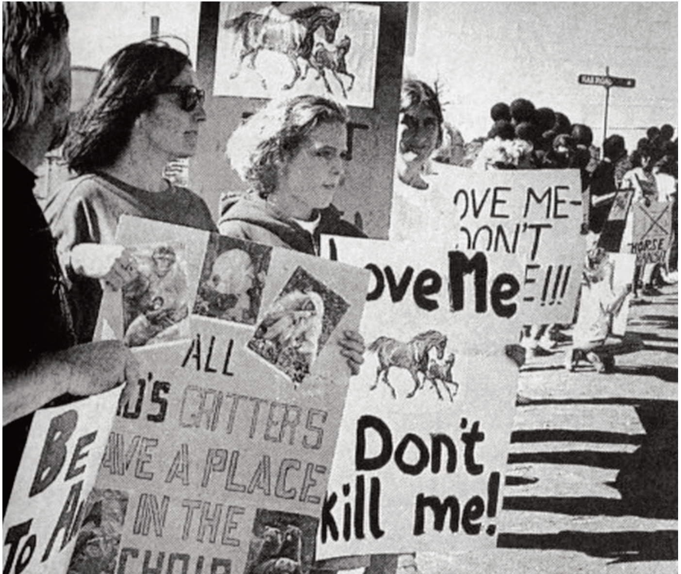
Protestors rally against the Cavel West Plant

respecting the land and the atmosphere around you. In that regard, I'm an environmentalist." What does the label "environmentalist" mean to you? What do people have to do to earn that label?