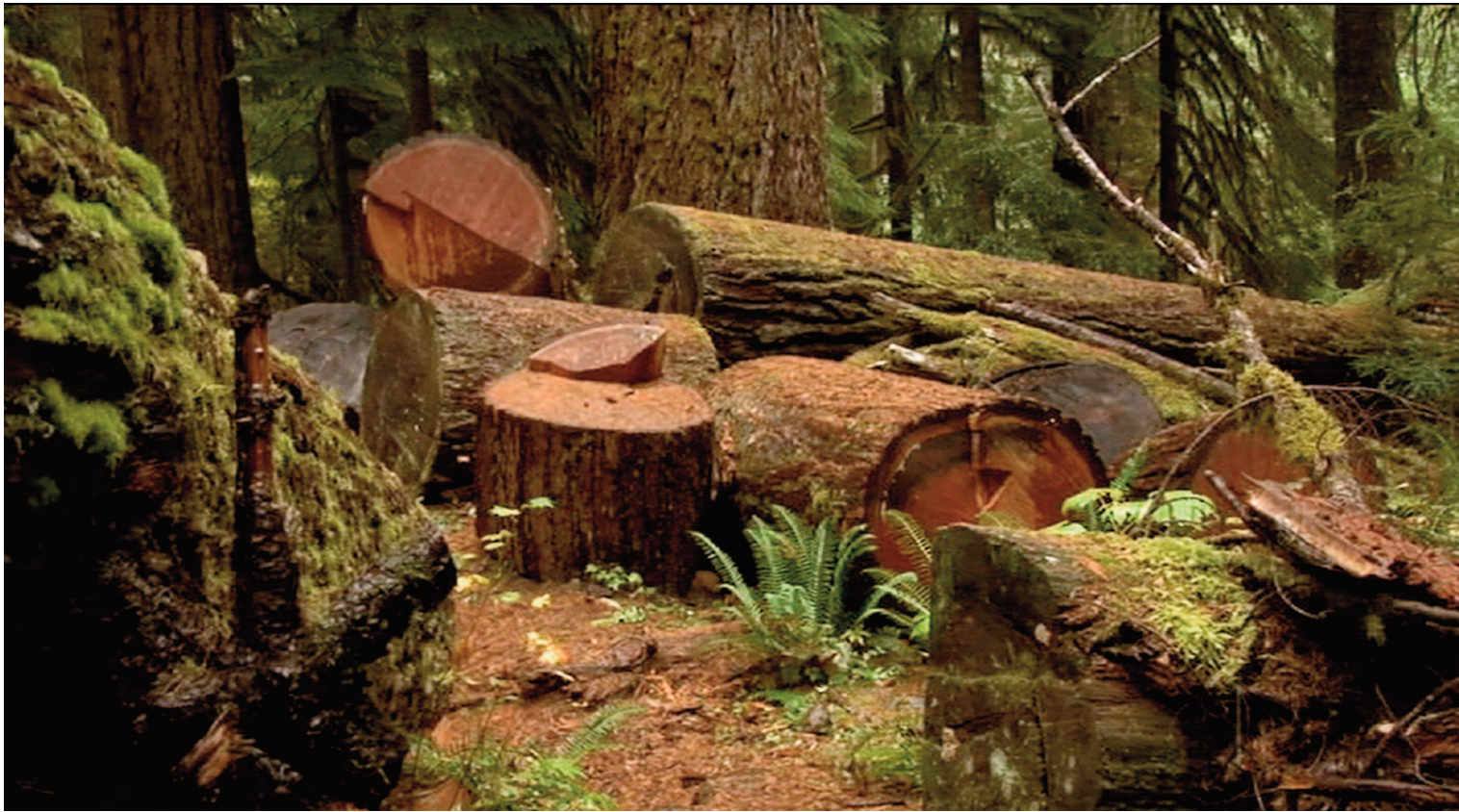
Felled trees in western Oregon Photo still from "If a Tree Falls"