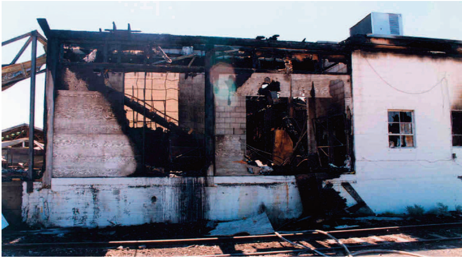
Caval West Horse Processing Plant, the site of an ELF arson Photo still from "If a Tree Falls"

the Animal Liberation Front (ALF), the ELF employs a "leaderless resistance" structure. Designed to reduce risk of infiltration by law enforcement, leaderless resistance eschews centralized authority and chain of command. The ELF has found that "this cell structure has been extremely effective in ensuring the continuation of the organization with minimal arrests."