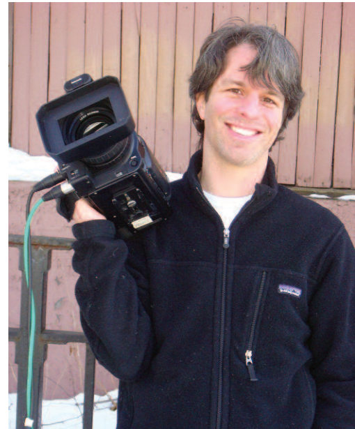
Director Marshall Curry