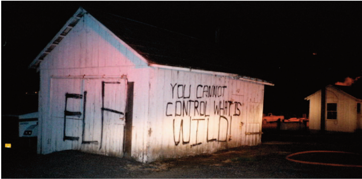
The ELF leaves its mark on the shed of Jefferson Poplar Farms after an arson