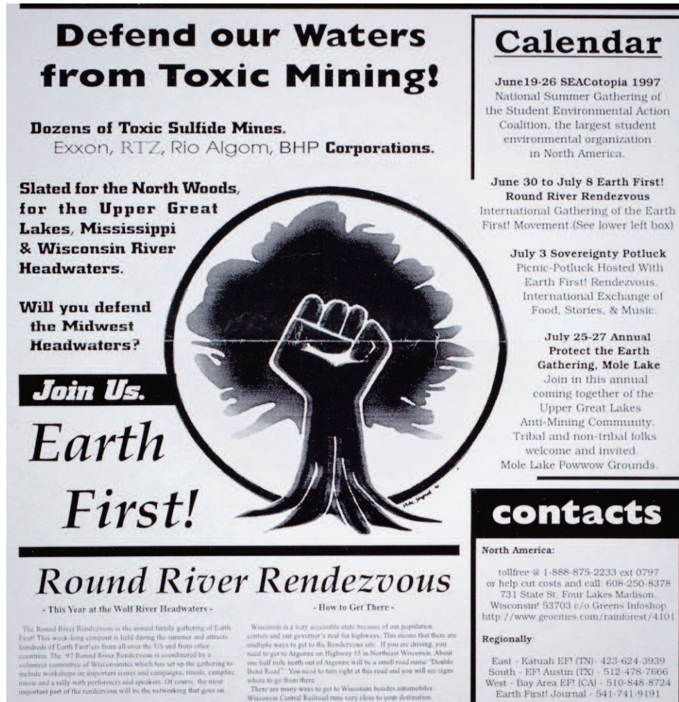
A flyer for the environmental action group, Earth First! Photo still from "If a Tree Falls"

ELF is more of a grassroots movement or philosophy than a centralized group, and its origins are not easily traced. Like