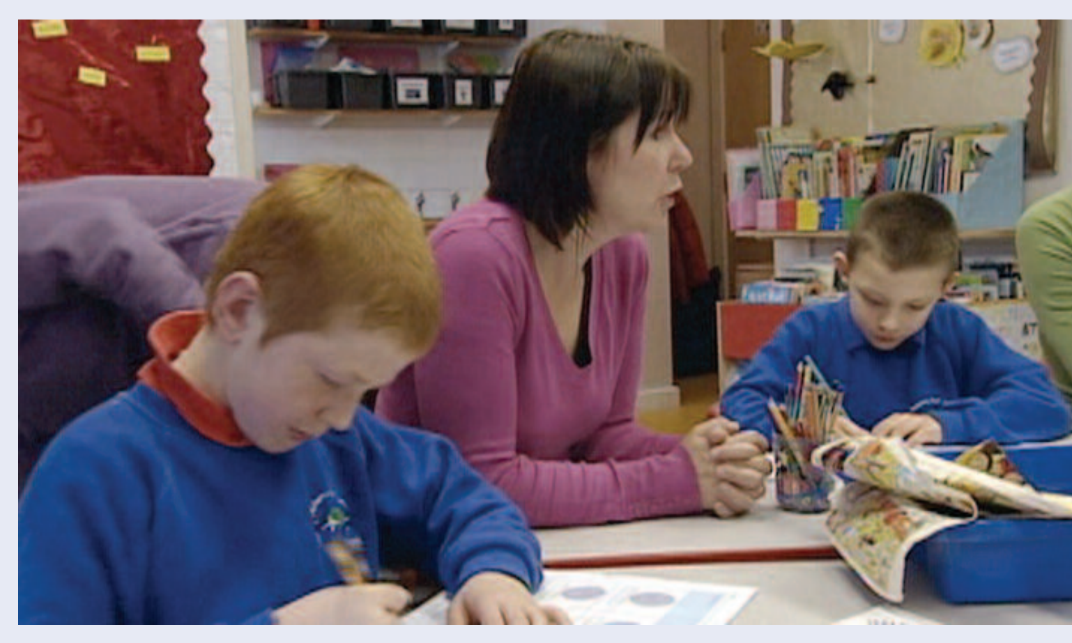
fordshire, England's Mulberry Bush School for emotionally disturbed children. At this unique boarding facility, the staff responds to antisocial, sometimes violent behavior with gentle restraint, calm words and clear limits. They draw out the deep loving capacity of these children, even as they get frustrated by repeated instances of unacceptable behavior. As viewers witness the daily dramas of troubled kids trying to survive, and the moments of hope they achieve with the school's determined team, they are challenged to question what society owes its most traumatized children and what

Hold Me Tight, Let Me Go (82 min) takes a vérité look at Ox-