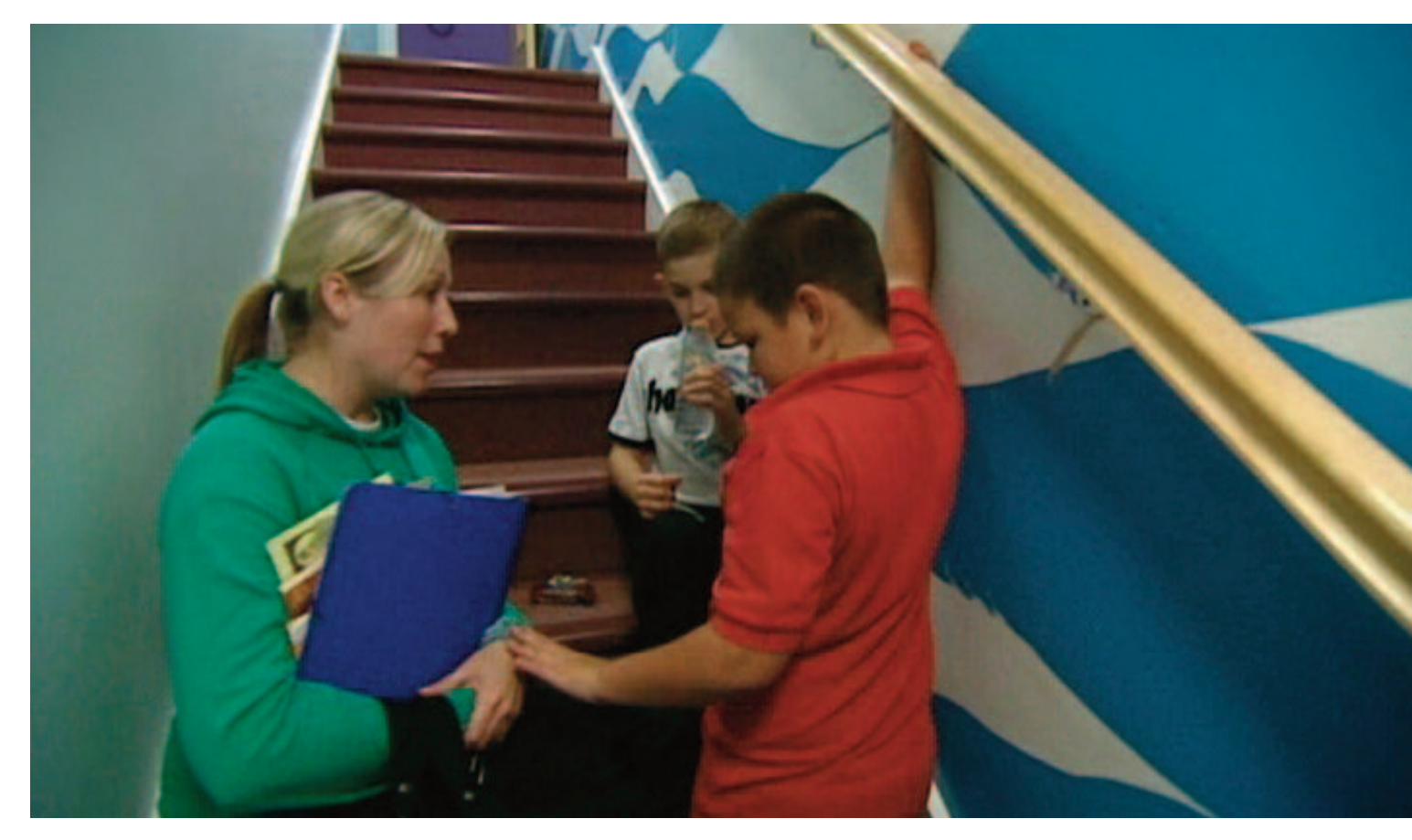
Mulberry Bush School.