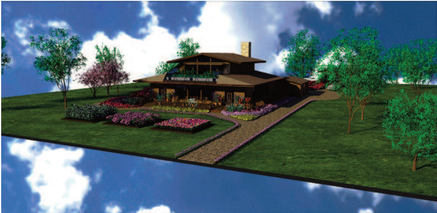
An architectural rendering shows inmate Herman Wallace's dream home.