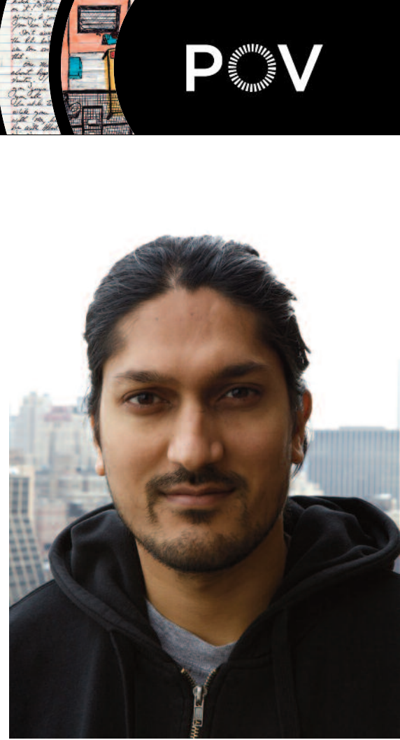
Filmmaker Angad Singh Bhalla.